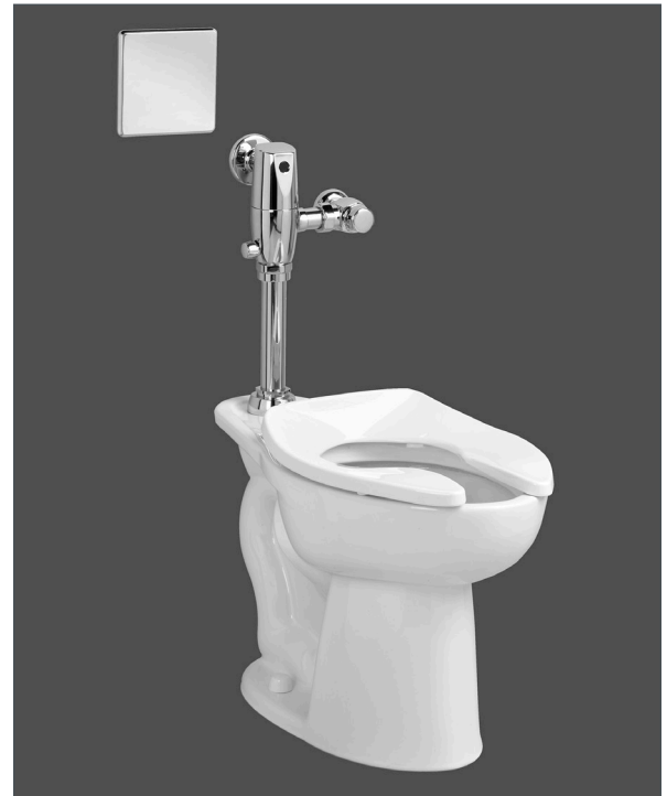
SEE REVERSE FOR ROUGHING-IN DIMENSIONS